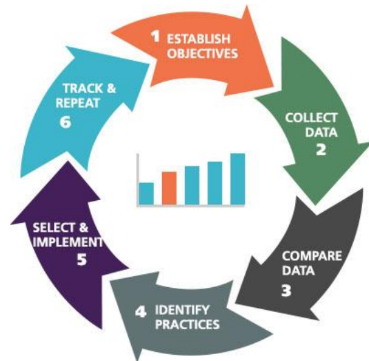
How to Get Value from the Benchmarking Process

Benchmarking may be the easiest and most cost-effective way to establish a baseline and document how your metrics compare with other leading institutions, whether you self-perform or outsource your facility management services. Our participants use the results to demonstrate responsible performance to agencies and donors, identify opportunities for potential improvement, and as a basis for establishing appropriate space, budget, and staffing forecasts.