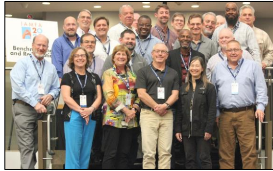
2022 Workshop attendees

Annual Workshop This 1 day in-person meeting is typically held the day prior to the annual IAMFA conference. The purpose is to review metrics, practices, and facilitate small group discussion and networking among facility managers of leading international cultural institutions. Hear firsthand what others are doing to reduce costs and/or improve performance, and hear the lessons learned from their implementation efforts. Read more.