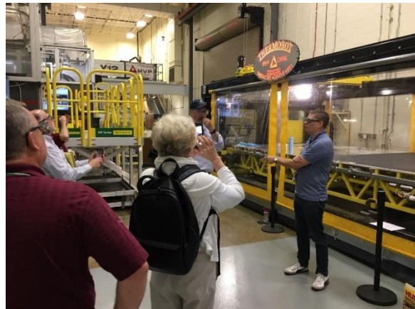
The group tours the additive manufacturing (3D manufacturing) research facility at 2018 meeting hosted by Oak Ridge National Lab.

Hear firsthand what others are doing to reduce costs and/or improve performance, discuss lessons learned, and see other facilities and operations.