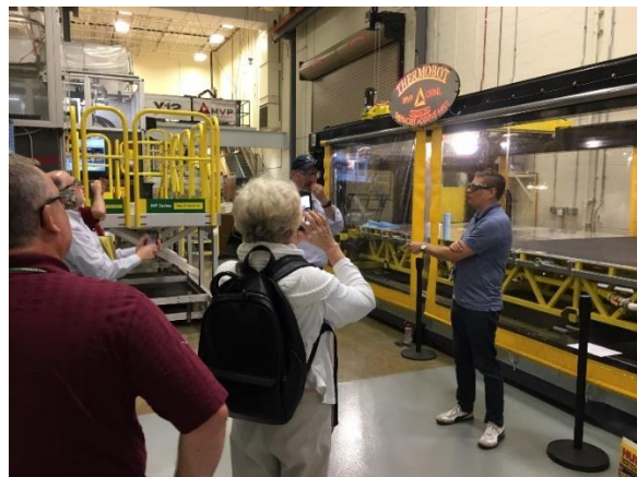
The group tours the additive manufacturing (3D manufacturing) research facility at 2018 meeting hosted by Oak Ridge National Lab.

Hear firsthand what others are doing to reduce costs and/or improve performance, discuss lessons learned, and see other facilities and operations.